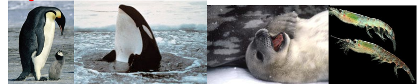
Penguins Orca Whales Weddell Seals Krill

Can people live in the Poles? Some people live in the Arctic, such as the Inuit people and some people visit Antarctica. People need to wear thick, warm clothing which is sometimes made of animal fur.